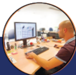
Electronics Development and Qualification