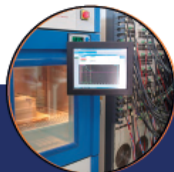
In-house Battery Testing Laboratory