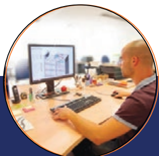
Electronics Development and Qualification