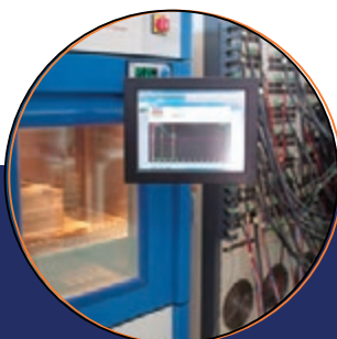
In-house Battery Testing Laboratory